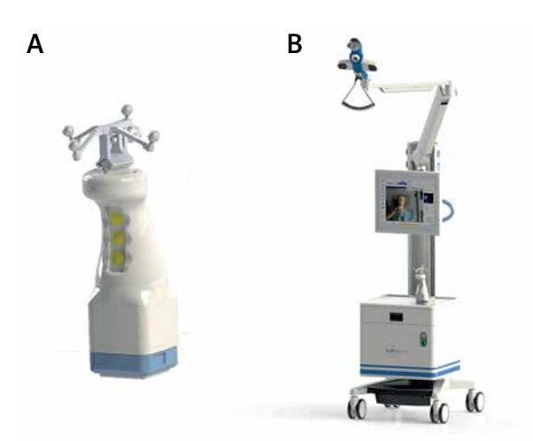
Photo 1. The declipse SPECT Imaging System. A – The high-resolution handheld Imaging Probe coupled with the tracking spheres. B – Tracking system and processing unit of the fhSPECT apparatus

specific mapping techniques that have been proven to be most effective. Therefore, evaluation of newly emerging mapping techniques that incorporate novel nodal visualization is crucial in ensuring better prognosis for BC patients. One such technique is the intraoperative visualization of lymph nodes, by incorporating real time three-dimensional (3D) field imaging via a multimodal system, called free-hand single-photon emission computed tomography (fhSPECT). This approach combines the previously used handheld gamma ( \gamma -) probe, with a two-point tracking system, and an infrared tracking camera capable of localizing and displaying the tracer distribution with a portable, small \gamma -camera [5, 6]. Until now, the use of fhSPECT has been documented in various oncological procedures, with few reports on axillary staging [6–12]. Existing literature describing the use of fhSPECT showcases superior lymphatic mapping results compared to lymphoscintigraphy in melanoma patients [6]. The mapping capabilities of the modality are also documented in the intraoperative localization of parathyroid adenomas in smaller-scale publications, with encouraging results nevertheless [7]. Previous comparisons with the gamma probe technique in smaller scale studies also revealed superiority of fhSPECT in terms of detection rates [5, 8]. Researchers have also identified the potential of fhSPECT to reduce false-negative rates (FNRs), provided that the scans are of good quality [12].