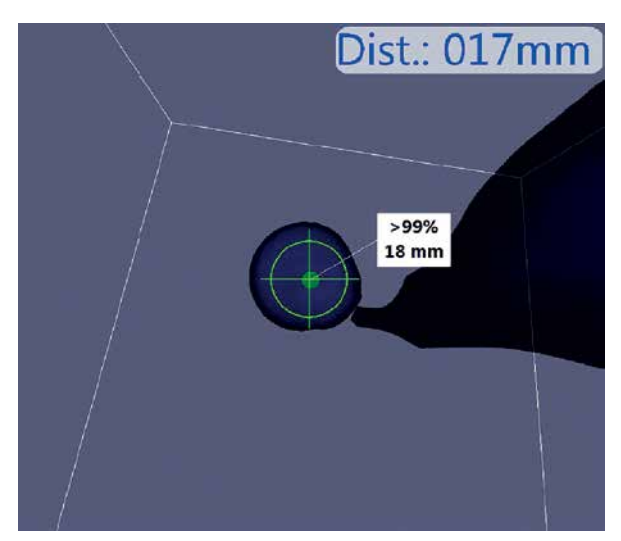
Photo 3. Intra-field reconstruction of the system. The targeted lymph node, emission rate, as well as the distance from the target can be clearly seen

The acquisition scan consisted of lateral, anteroposterior and caudocranial views, lasting approximately 4 min, defining the rectangular volume of interest (VOI) – a three-dimensional virtual cubic space within which the SPECT camera system was to scan for emitting hotspots (Photo 2). This was done in a way similar to the protocol proposed by Wendler et al. [12]. The \gamma -probe was placed just above the skin level, with a cranial direction. Meanwhile, a continuous