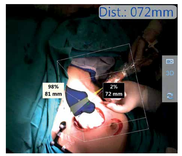
Photo 2. The surgical field imaging, as taken from the processing unit. The system's VOI, detected hotspots, distance from target, as well as both tracking devices are visible

The acquisition scan consisted of lateral, anteroposterior and caudocranial views, lasting approximately 4 min, defining the rectangular volume of interest (VOI) – a three-dimensional virtual cubic space within which the SPECT camera system was to scan for emitting hotspots (Photo 2). This was done in a way similar to the protocol proposed by Wendler et al. [12]. The \gamma -probe was placed just above the skin level, with a cranial direction. Meanwhile, a continuous